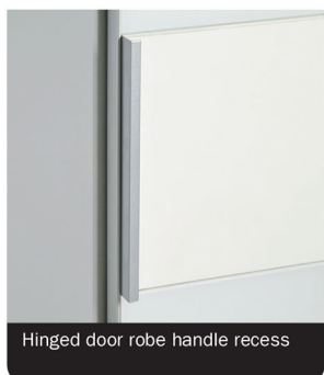
Hinged door robe handle recess