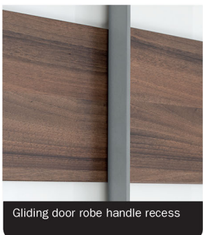
Gliding door robe handle recess